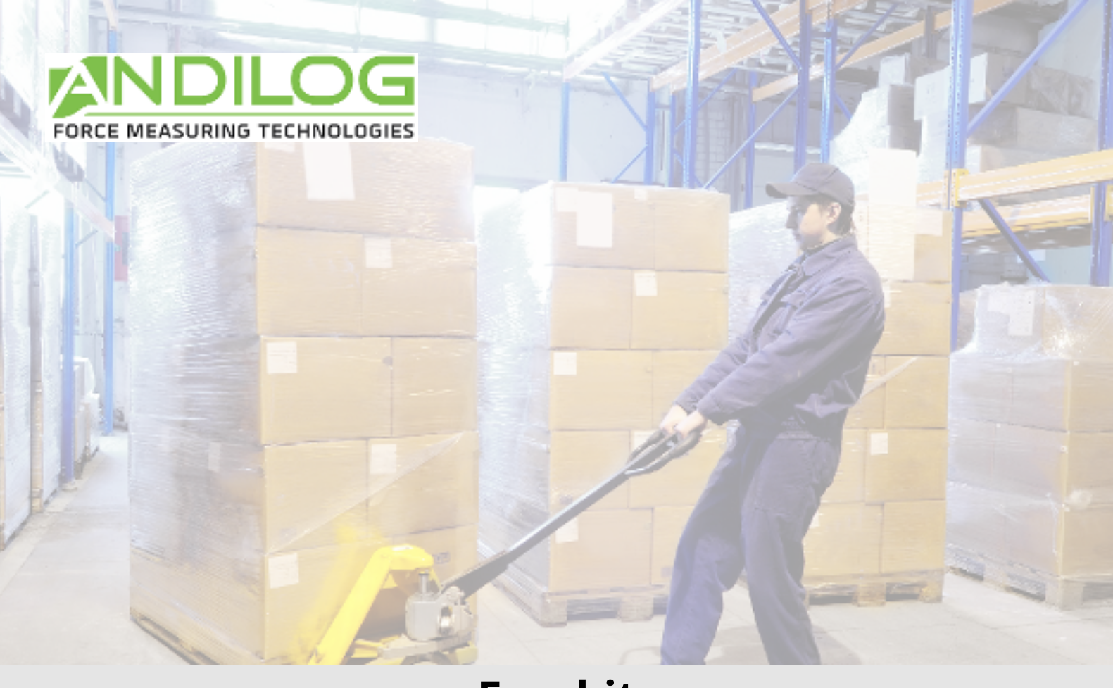
Ergokit Force gauges for ergonomics studies